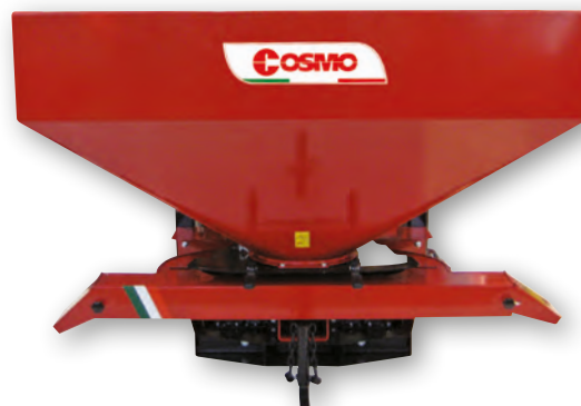
Pictured with optional Twin Side Distributor