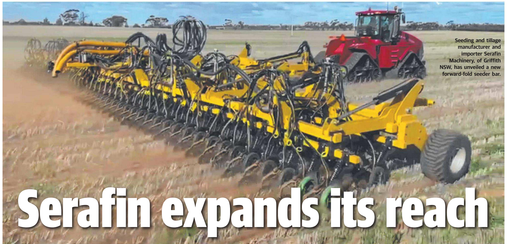
Seeding and tillage manufacturer and importer Serafin Machinery, of Griffith NSW, has unveiled a new forward-fold seeder bar.

To find out more visit farmimplements.com.au