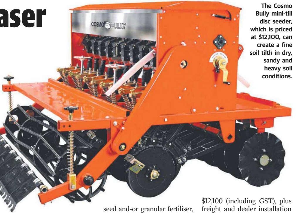
The Cosmo Bully mini-till disc seeder, which is priced at $12,100, can create a fine soil tilth in dry, sandy and heavy soil conditions.

"The machine is fitted with two independently calibrated