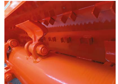
Hammers and internal debris catching lugs

Belt drive transmission: smooth, low maintenance, cost-effective.