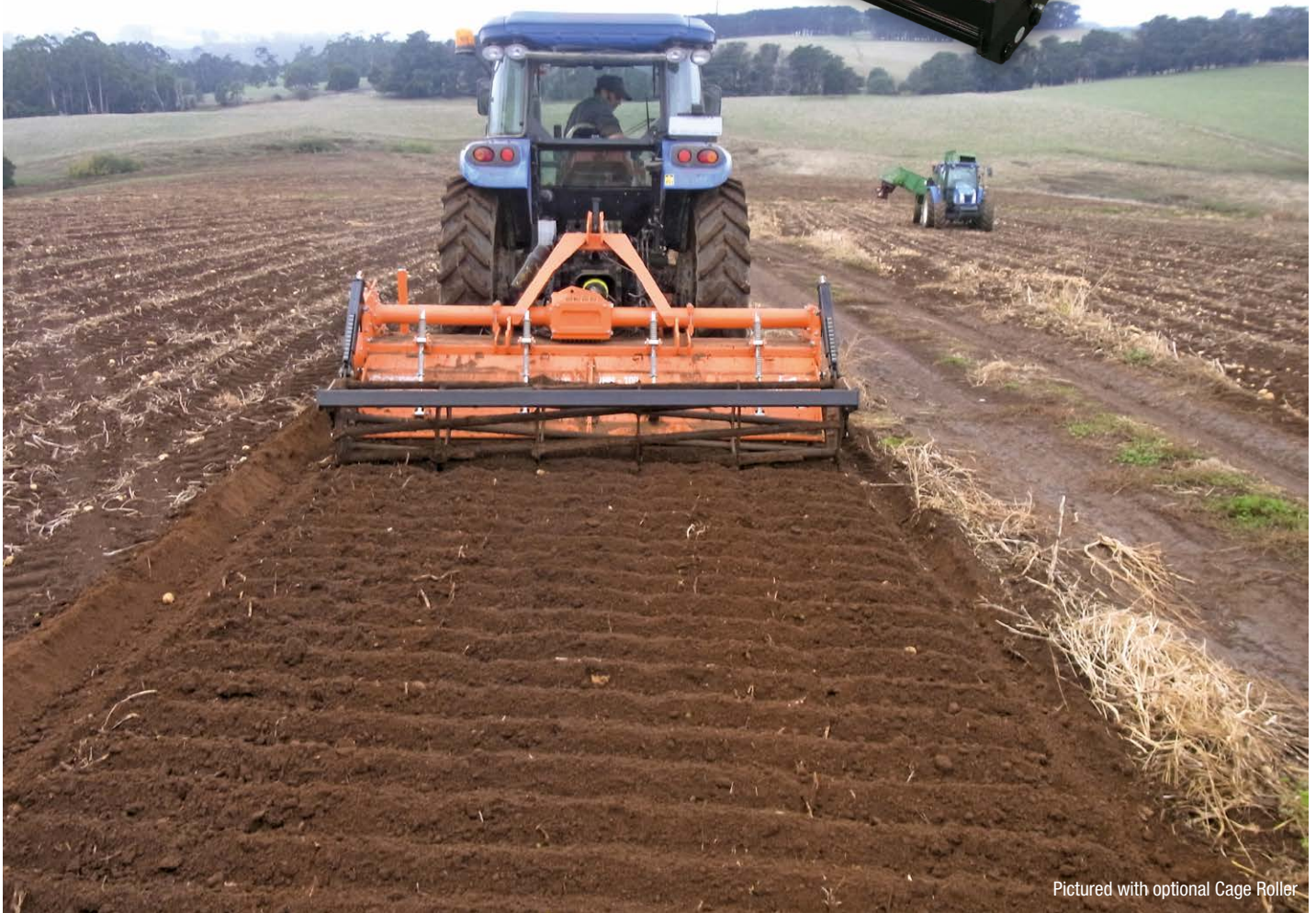
Pictured with optional Cage Roller